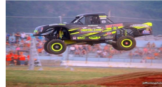
JM MOTORSPORT PRODUCTIONS INC. 2017 Entry Form